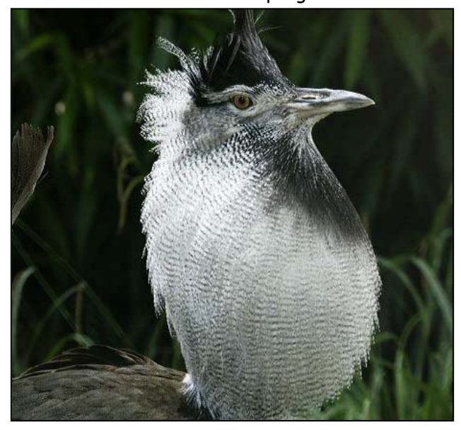
Pointy beak/Eyes positioned on side of head