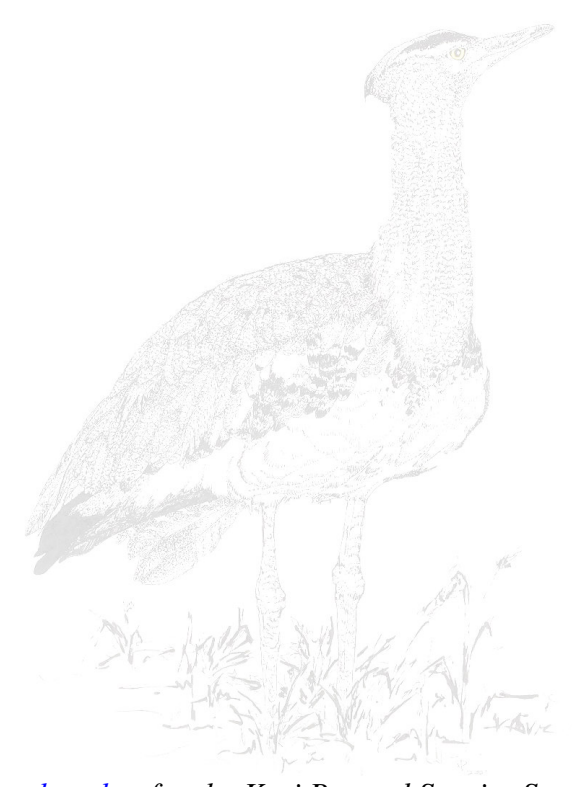
Created with Puzzlemaker for the Kori Bustard Species Survival Plan 2006